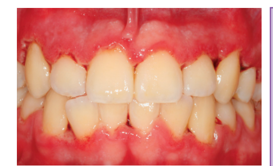
Figure 1. Acute necrotizing ulcerative gingivitis with 3-4 mm probing depth and 15% horizontal bone loss in a 24-year-old male. (Stage 2, Grade B.)

Studies investigated the predictive values of absence of BOP as an indicator for periodontal stability. While the positive predictive value remained rather low for repeated BOP prevalence —