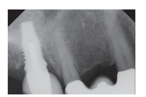
Figure 5. A radiograph of peri-implantitis caused by plaque? excess cement? occlusal trauma? (See Figure 6)