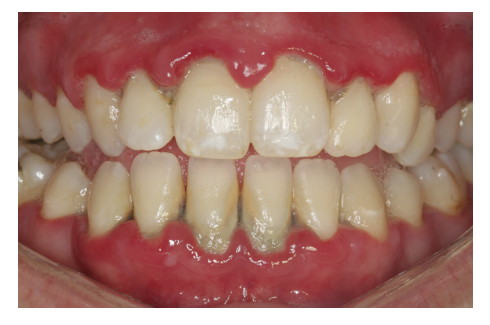
Fig. 2. Periodontal disease associated with local factors and uncontrolled diabetes in a 50-year-old male. Probing depth was 5-6 mm with 25% horizontal bone loss. (Stage 3, Grade C.)

Occlusal trauma does not initiate periodontitis, and there is weak evidence that it alters the progression of the disease. Reduction of tooth mobility may enhance the effect of periodontal therapy.