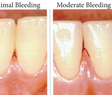
Figure 4. Bleeding on probing (BOP) should be the primary parameter to set thresholds for gingivitis. Minimal Bleeding: Twenty to thirty seconds after probing the mesial and distal sulci with a periodontal probe, a single bleeding point is observed. Moderate Bleeding: A fine line of blood, or several bleeding points, become visible at the gingival margin.